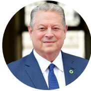
Al Gore Former Vice President of the United States and Chairman of Generation Investment Management