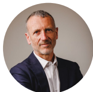
Emmanuel Faber Chairman, ISSD