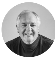
Paul Polman Business leader, climate and equality campaigner, co-author of "Net Positive"