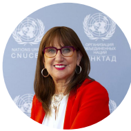
Rebeca Grynspan Secretary-General, UNCTAD