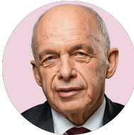
Ueli Maurer Swiss Federal Councillor