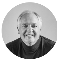
Paul Polman Former CEO, Unilever; Co-founder & Chair, Imagine