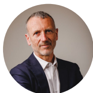
Emmanuel Faber Chairman, ISSD