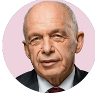
Ueli Maurer Swiss Federal Councillor