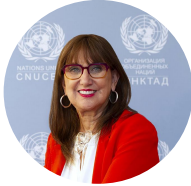
Rebeca Grynspan Secretary-General, UNTCAD