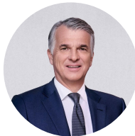
Sergio P. Ermotti Chairman Board of Directors, Swiss Re